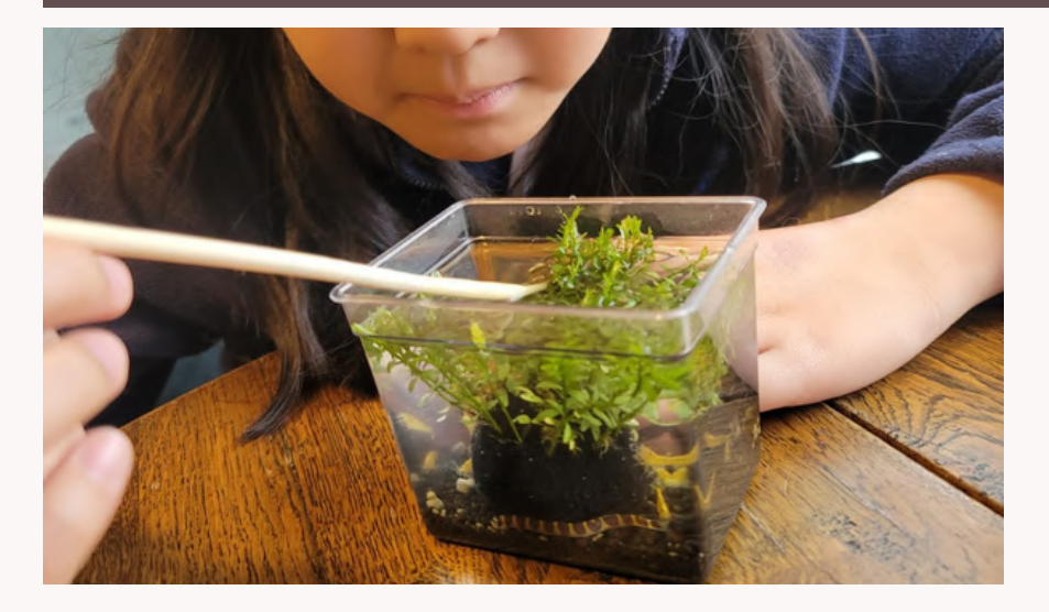
Watching Shrimps Grow Photo taken at See Change's Science & Nature Camp

Experiential Learning : Witness the Lifecycle of a Bug How can children develop a true understanding of what it means to care for animals? In addition to explaining the hard truths from stories and books, you may like to let your child learn through experience.